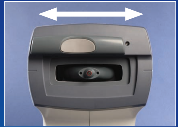
Headrest enables easy patient positioning

Operation of Reichert 7 is extremely quick. Patients simply lean against the forehead rest while the operator touches an icon on the screen to activate the fully automated alignment and IOP measurement process. The measurement is taken with speed and simplicity unlike any other NCT, without sacrificing accuracy.