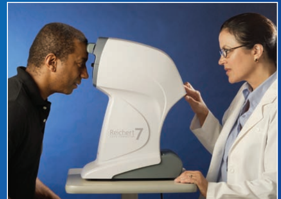
No joystick, chinrest or elevation controls necessary 1