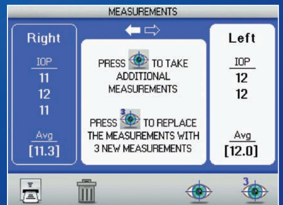
Clearly displayed measurement options and data