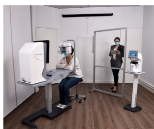
Wireless remote control